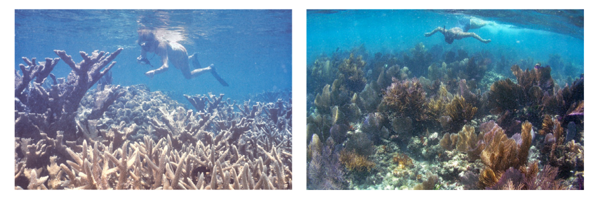
Fig. 2 The worldwide loss of reef-building corals, the architects of coral reef habitats, threatens the persistence of coral reef ecosystems and the services they provide to people. This reef site in the Florida Keys transitioned from dominance of tall, branching reef-building corals in 1971 (left) to dominance of non-reef building organisms by 2004 (right), a pattern occurring on many reefs due to local and global human stressors.

Warmer ocean temperatures will also increase the intensity and frequency of storm events. Intense storms can cause physical damage to coral colonies via high swell events and can reduce coastal water quality via high precipitation events. Increased storm intensity and frequency will also increase nutrient and sediment loads onto reefs. Because corals thrive in nutrient-poor, clear waters and are susceptible to smothering by sediments, elevated runoff negatively affects coral health in several ways. Increased sediment loads may also be exacerbated by changing coastal vegetation from the higher temperatures and drought events caused by climate change, which can cause soil destabilization (Hoegh-Guldberg, 2011).